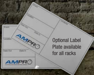
Optional Label Plate available for all racks